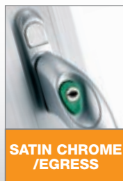
SATIN CHROME /EGRESS