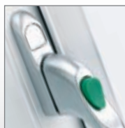
SATIN CHROME /EGRESS