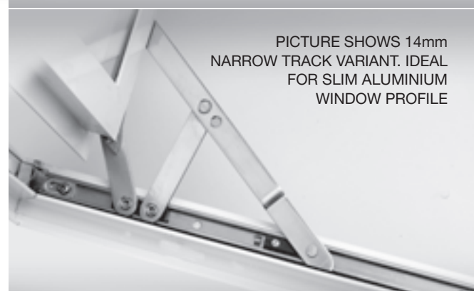
PICTURE SHOWS 14mm NARROW TRACK VARIANT. IDEAL FOR SLIM ALUMINIUM WINDOW PROFILE