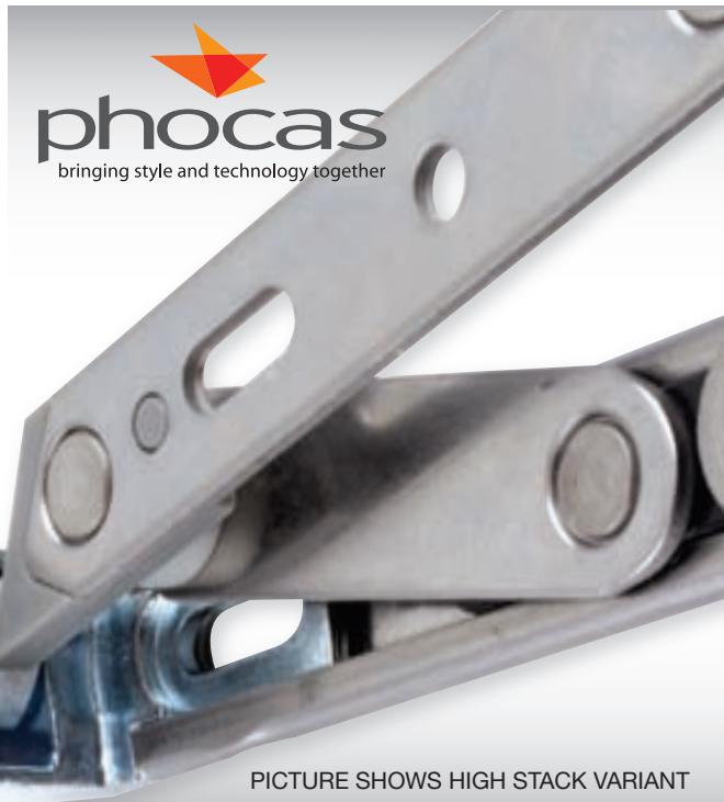
PICTURE SHOWS HIGH STACK VARIANT

Also available in narrow track format on request