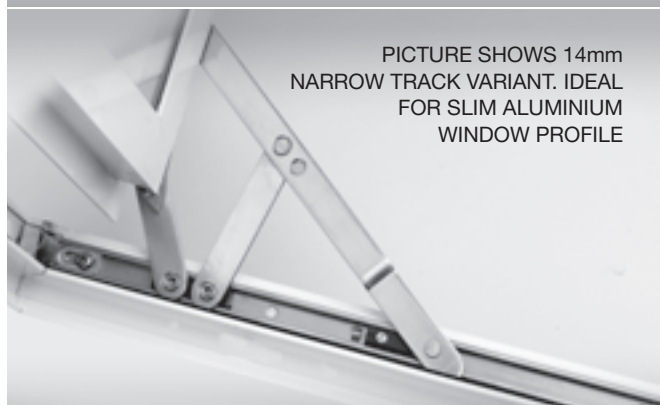
PICTURE SHOWS 14mm NARROW TRACK VARIANT. IDEAL FOR SLIM ALUMINIUM WINDOW PROFILE