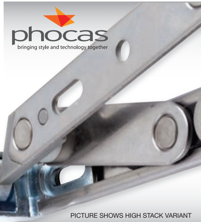
PICTURE SHOWS HIGH STACK VARIANT

*Applicable to the life of the installed window and subject to Avocet's mechanical warranty and maintenance instructions.