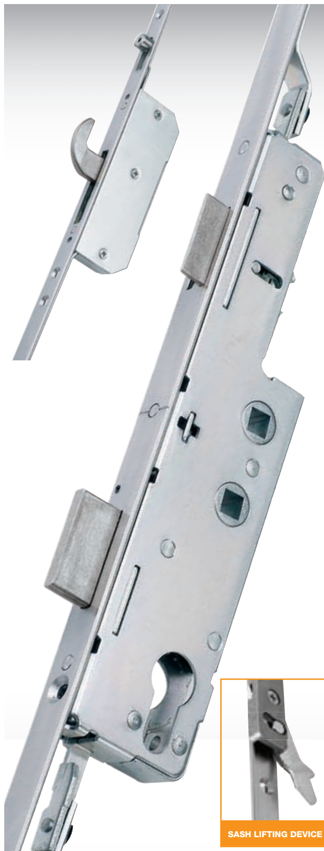
SASH LIFTING DEVICE